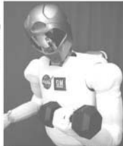
Robonaut pumps a little iron.